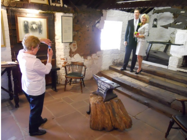
A photo-op after the wedding