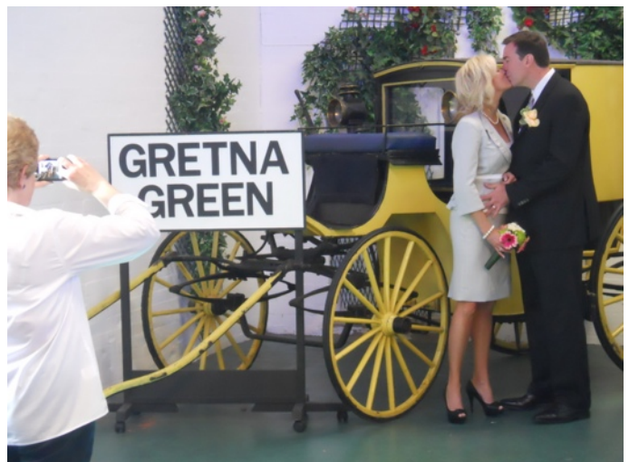
And one last smooch before hitting the road ...