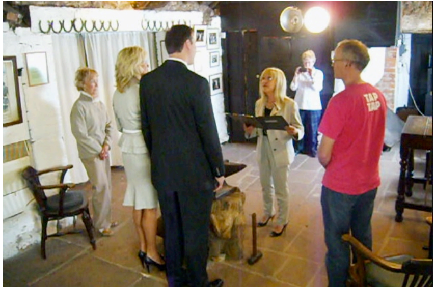
A study in contrasts: My mom and I witness the civil-marriage ceremony of an eloping couple from Utah we called Ken & Barbie, at the Old Blacksmiths Shop in Gretna Green, Scotland.

We pulled up at a mall named after its main attraction, the Old Blacksmiths Shop. I headed through the arcade, bought some Springbank single malt at a whisky outlet, then took my mom and my teenage daughter to the old smithy. Since the early 1800s, underage couples (or sometimes grown men and adolescent girls)